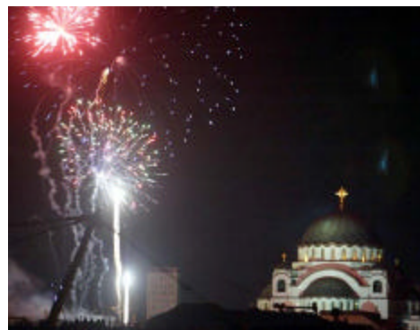
Fireworks above Belgrade Temple of St. Sava during the celebration of Orthodox New Year