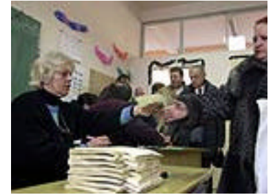
Counting votes in polling station 17

However, most political parties rejected the idea, including the SRS. But political analyst Djordje Vukadinovic argues that the idea of an all-party government was the "most logical solution" and its rejection by the "reformist bloc" was "short-sighted." "It is much better to invite the SRS through a small door than to let them triumphantly enter through the main door alone in six months or in a year, if things do not radically change," Vukadinovic said.