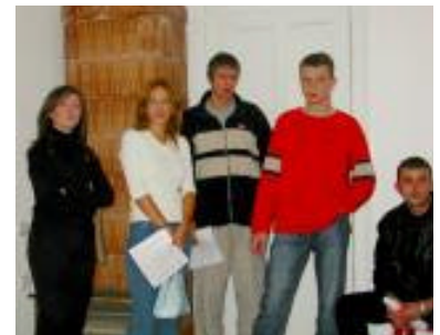
Recipients of this year's awards

The SUC Belgrade Office presented the first set of Studenica Foundation scholarships for the school year 2003/04 on November 10th at a special award ceremony in the Belgrade headquarters.